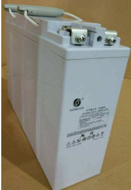
Model FTB12-100 II